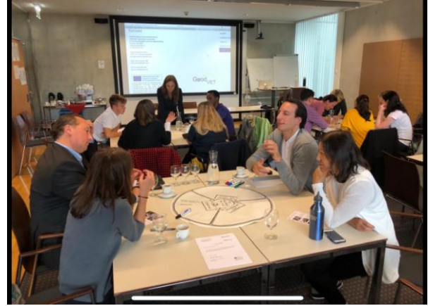
Figure 3 Multiplier Event Innsbruck 14 th of October .2019

The exchange and dialogue between actors or target groups and project managers was promoted within the events. The participants had the opportunity to learn more about the project and the indicators and were thus able to analyse their own approach to the implementation of measures for the integration of fugitives through vocational training and improve it sustainably based on the research results.