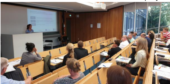
Figure 2 Multiplier Event Cologne 2 nd September 2019

In addition, a multiplier event with interested actors from politics and practice took place in each of the four partner countries at the end of the project.