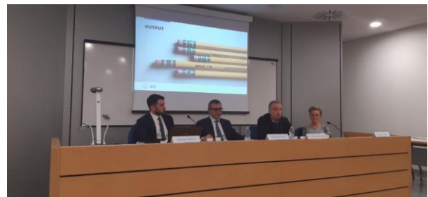
Figure 4 Multiplier Event Bergamo 17 th of October 2019

The exchange and dialogue between actors or target groups and project managers was promoted within the events. The participants had the opportunity to learn more about the project and the indicators and were thus able to analyse their own approach to the implementation of measures for the integration of fugitives through vocational training and improve it sustainably based on the research results.